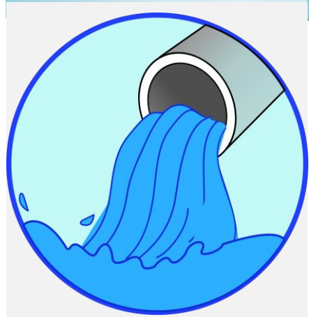
PUMPING THE TAILWATER By Ray Luhman

In January of every year the Kansas Geological Survey (KGS) measures wells throughout the High Plains Aquifer. The above map shows the results of those measurements with an average water level change for GMD 4 of +0.26 feet. This data shows that with above average rainfall and unfortunate hail events resulting in less pumping, the aquifer responds.